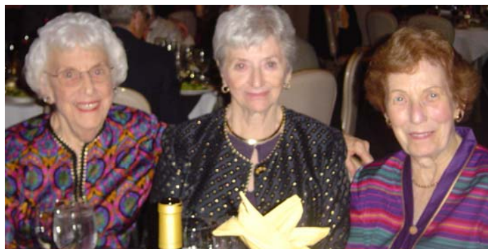
RESIDENTS ENJOYING 25 th Anniversary SOLID GOLD BALL AT THE ROUNDHILL COUNTRY CLUB IN ALAMO ON NOVEMBER 4, 2006