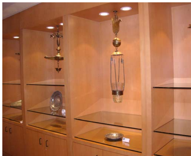
Items on display from the Eis Collection